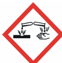
Corrosive to metals